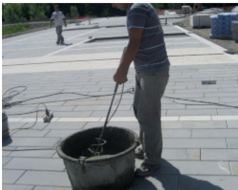
Mix Mapestone PFS 2 with water only using a mixing attachment or cement mixer