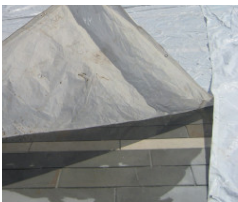
An example of how to protect the paving