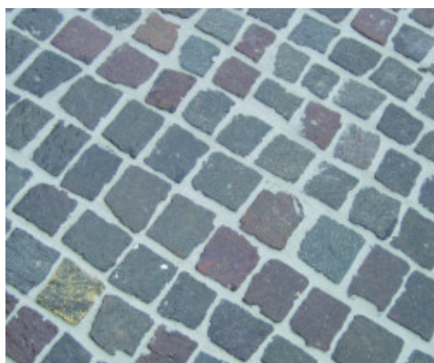
Small porphyry blocks laid in straight rows