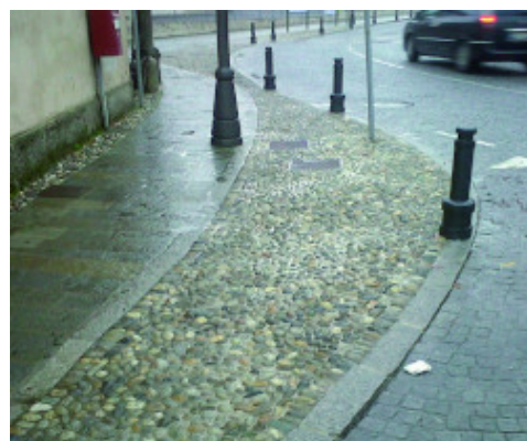
An example of flooring in cobblestones, slabs and porphyry setts