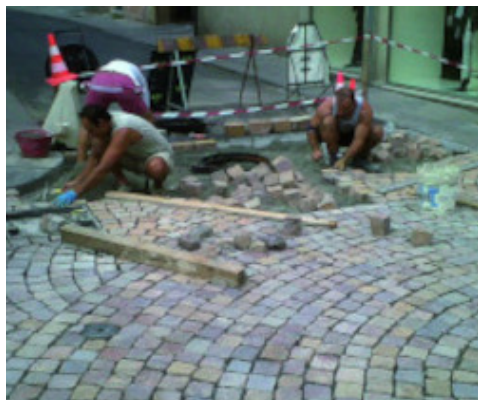
An example of small blocks in a circular pattern

ANY ALTERATION TO THE WORDING OR REQUIREMENTS CONTAINED OR DERIVED FROM THIS TDS EXCLUDES THE RESPONSIBILITY OF MAPEI.