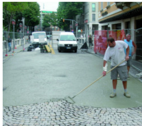
Spreading the slurry on the wet stone