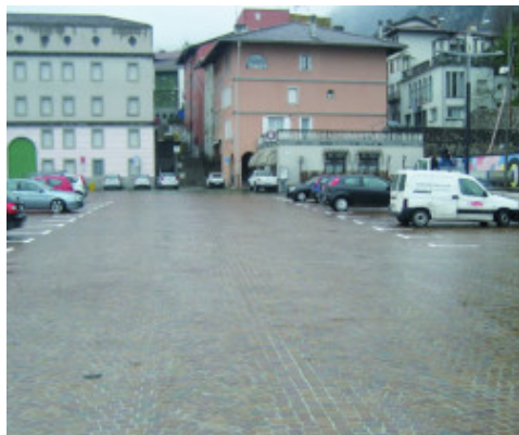
An example of a piazza used as a car-park